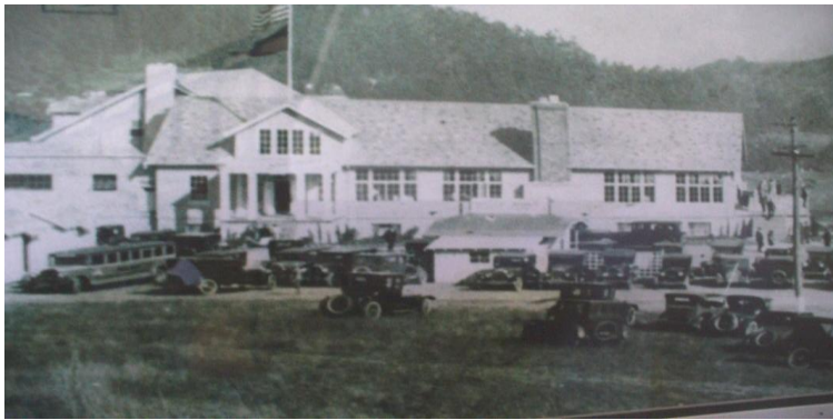
Belle Monte County Club, 1920s