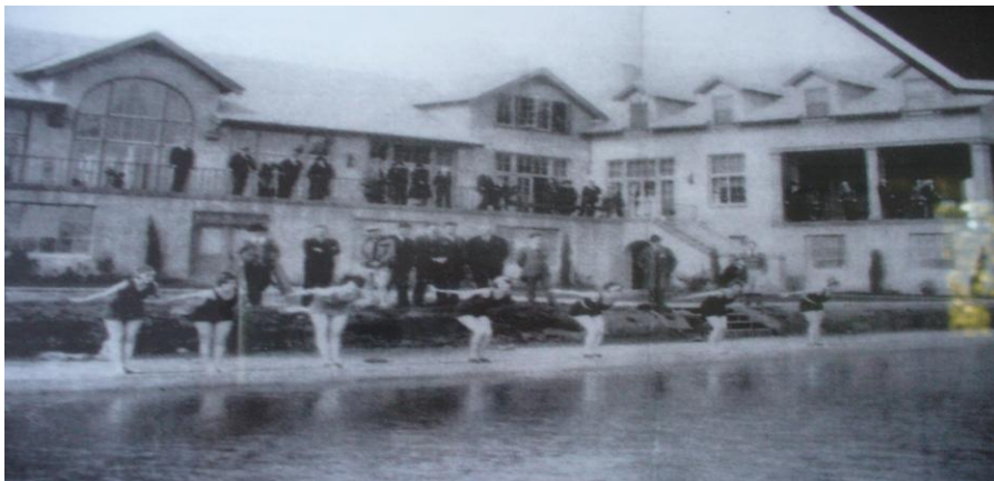
Belle Monte Pool in the 1930s

Since CPNS is still play-based, we are honoring the spirit of these people who seem to be having a great time swimming!