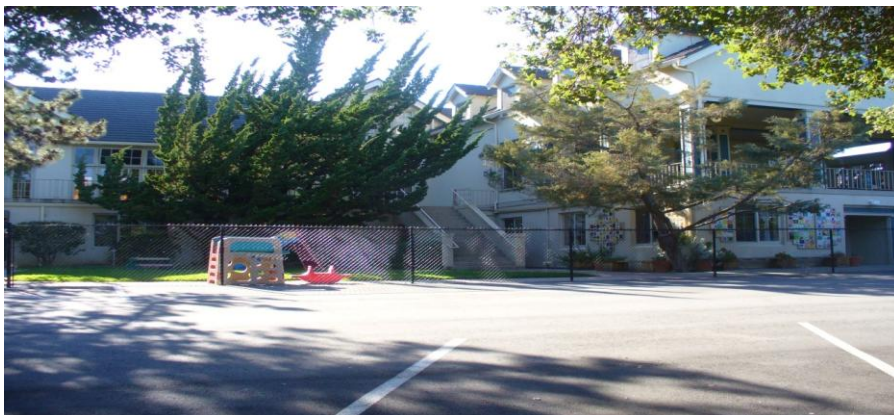
CPNS today where the pool once was, 2008