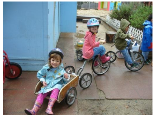
Fun in the rain, 4pm class 2008