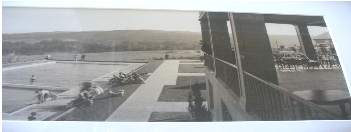
Belle Monte Pool, same walkways are used today to ride bikes at CPNS

During the Belle Monti Country Club days, these same walk ways were used to get to the pool and to sunbathe near, today they are used by many preschoolers to ride tricycles and be pulled in wagons. In the summer, they are run on to get in the blow up pool and through the sprinklers.